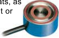
Pavement mount snow sensor

ClearZone electric snow melting systems are fully automated and maintenance free. The state-of-the-art systems utilize the industry's premier heating cables and mats, as well as an advanced pavement or aerial mounted snow sensor, depending on your needs.