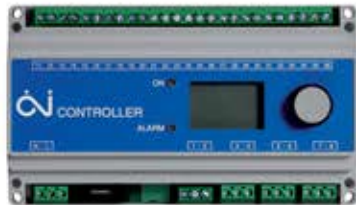
Snowmelt system controller

The Warmzone master control unit offers a maintenance-free snow melting system for residential and commercial business owners. The snow melting system controller features manual override capability for times when the wind creates snow drifts on the driveway, or if ice forms due to wind, shade or other conditions.