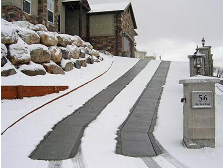
Driveway with ClearZone heated tire tracks