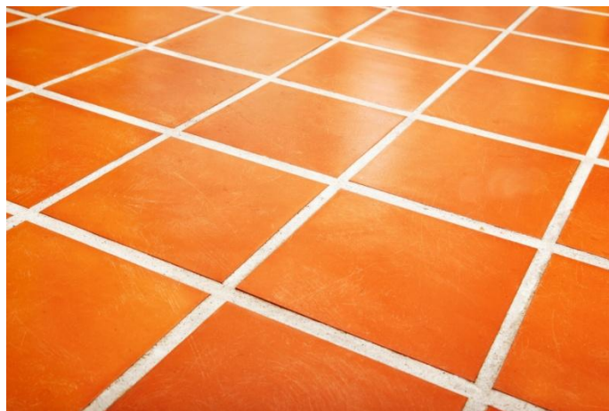
Residential and Commercial Floor Heating Systems