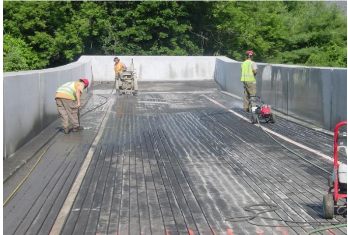
Residential and Commercial Snow Melting Systems