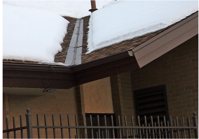
Roof Deicing Solutions