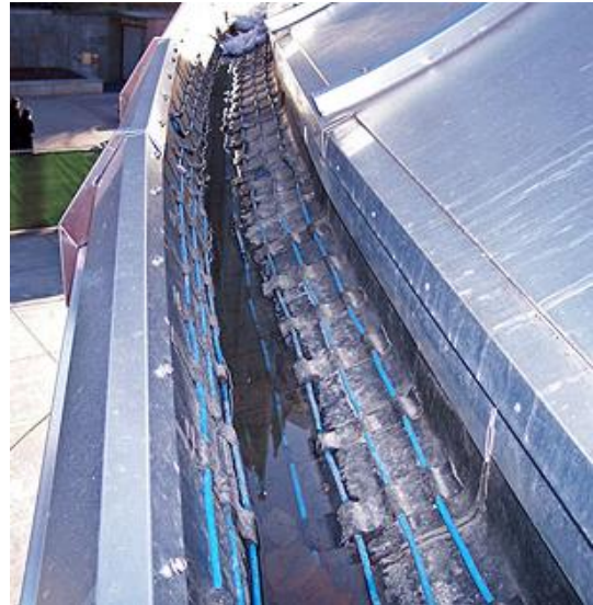
Heat cable installed for commercial gutter heat trace system (SLC Tabernacle)