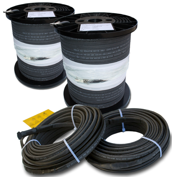
Warmzone self-regulating heat cable.